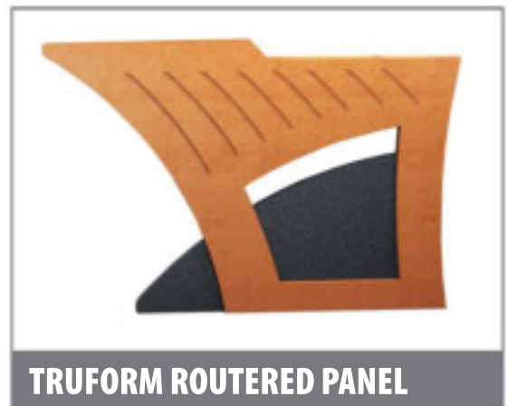
TRUFORM ROUTERED PANEL

Our TruForm side panels feature a vacuum formed rigid thermofoil, which can be applied to contoured surfaces. The dimensional flexibility eliminates the need for T-molding, edge banding and other special edge treatments. Durability and flexibility make TruForm side panels the perfect complement to any console.