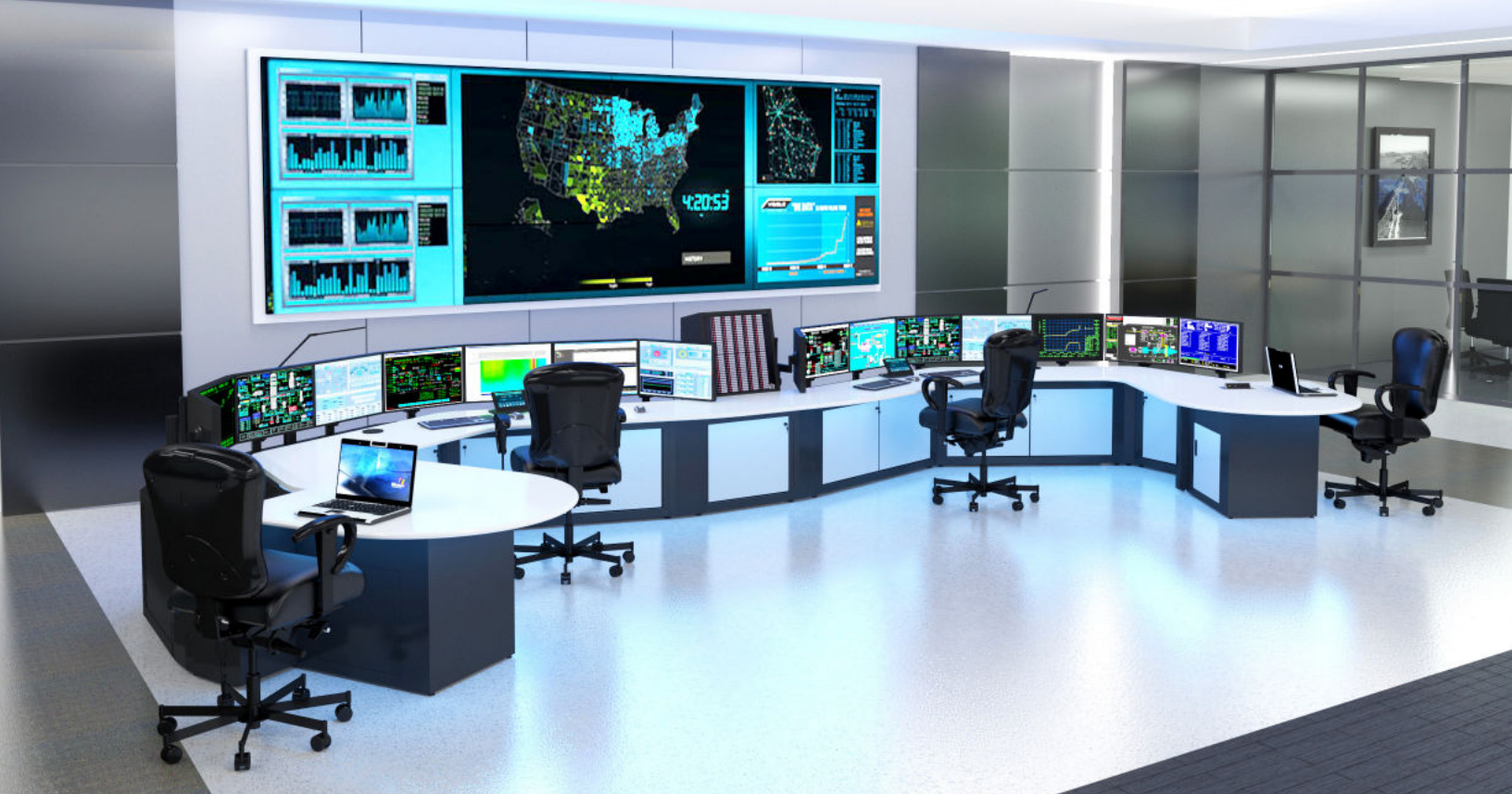
Consoles have extensive functionality advantages over basic office furniture.