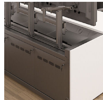
Front and Rear Access