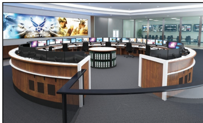
Custom control room consoles designed to your exact specifications.

If you're looking for a workplace as unique as the technical environment you work in, look to Winsted. We understand that in complex technical environments like yours there are countless intricate details to consider. From the comfort of your operators, to the aesthetics of your space, our designers will work with you from initial concept to final installation. We will ensure that your solution is perfectly designed to meet your needs in both form and function. Winsted designers have the insight and experience to take your most complex control room from concept to reality.